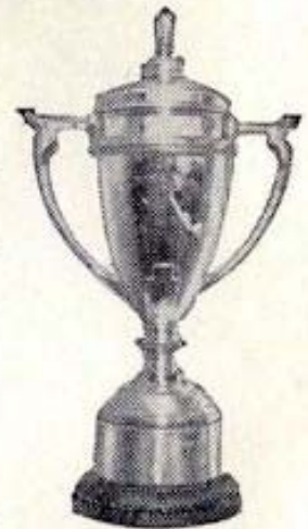
F.A. Youth Cup 1960 and 1961