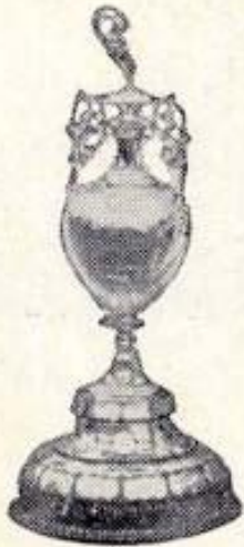
League Champions 1955