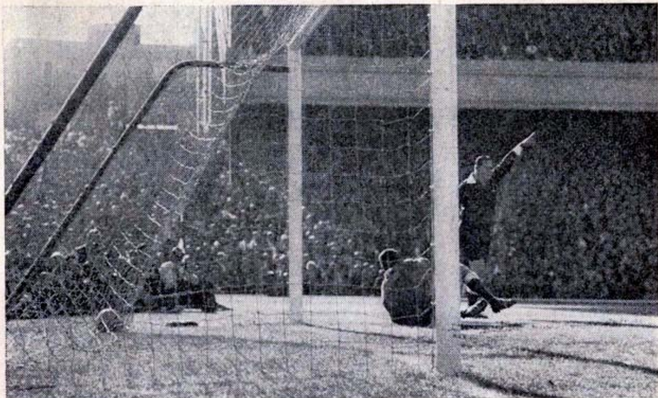
Keeper beaten, ball in the net, referee pointing to the centre—it all adds up to the goal of the match, our second, by Terry Venables from 25 yards.

SUM TOTAL : 4-1 + 4-1 + 3-0 + 4-2 + 3-1 = 18-5