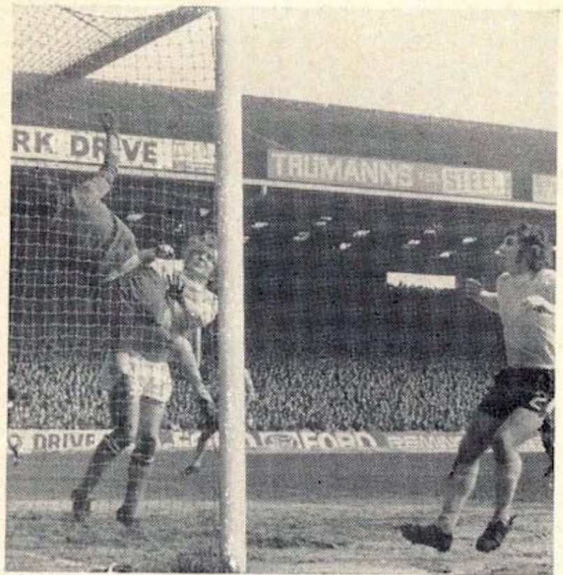
Above: Peter Bonetti steers a high centre over the bar, and Paddy Mulligan gets the next best view to Francis Lee.